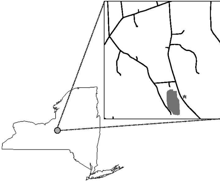
FIG. 1. Location of the study site at Labrador Hollow in New York State. The pond is shown by the grey shape in the inset map, with the approximate position of the arrays represented by the asterisk. Roads are shown as black lines.

flowing in a clearly defined channel and seeps where flowing water was present but with no clear channel); and whether any wetlands were found within 15 m of the road's edge on the downslope side of the road, as indicated by the presence of hydrophytic vegetation and standing water. We chose 15 m because further downslope from the road's edge there was a continuous strip of wetlands bordering the edge of Labrador Pond. Wetlands closer to the road (i.e., within the 15-m distance we assessed) represented seeps or drainages down which we postulated salamander may prefer to travel during migration. Roadside vegetation (i.e., grasses and herbs), forest canopy cover, and the presence of a drainage ditch remained constant along the transect. Thus, we did not include these covariates in our analyses.