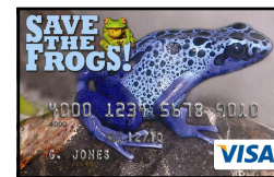
__ Card E

Please mail completed application to: UMB Card Center / Attn: Betty Thomas MS 1110505 906 Grand Blvd. Kansas City, MO 64106