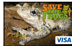
__ Card D