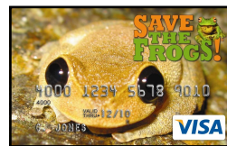
__ Card C